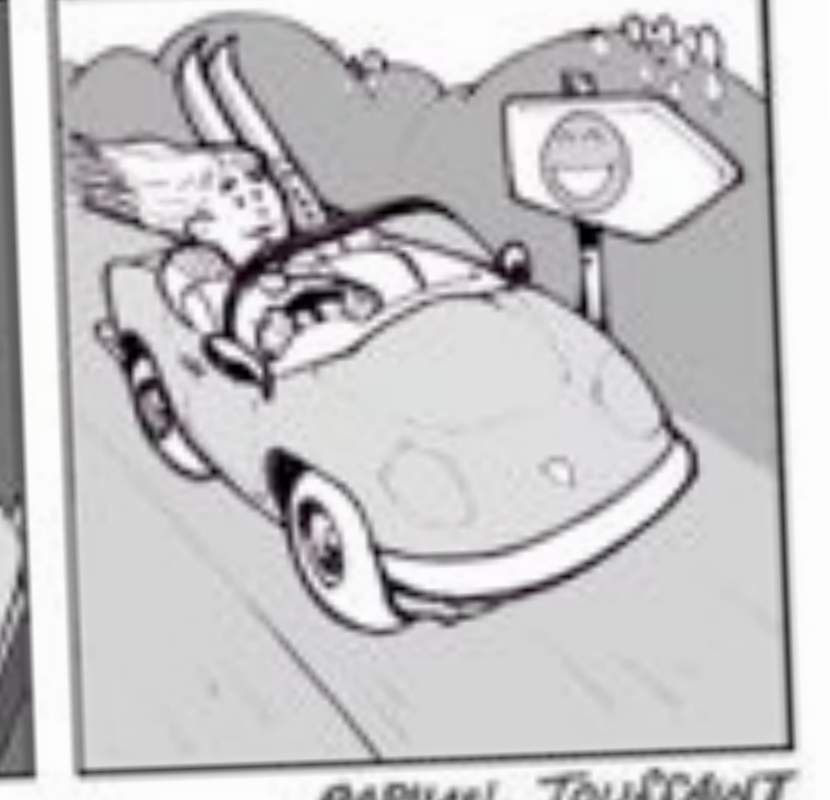
RECOVERING FROM ANOREXIA AND „CARPE DIEM“